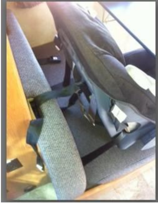
3) Child seat being installed. Tether and lap belt attached (but not cinched)