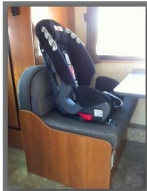
2) Child seat placed on Dinette – unattached