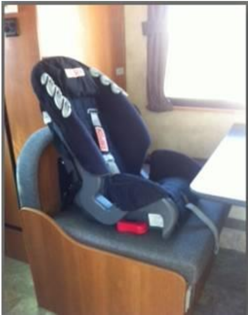
5) Child seat fully installed and cinched tightly