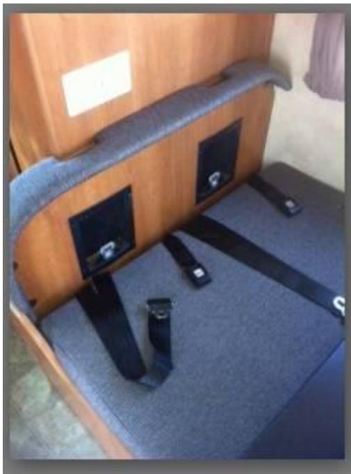
1) Dinette seat and backrest removed

The pictures below show Child Seat tethered without the seat cushion backrest. This is optional—it makes it easier to install/set-up, but leaving the backrest in place works too. There is not much difference in installing it either way.