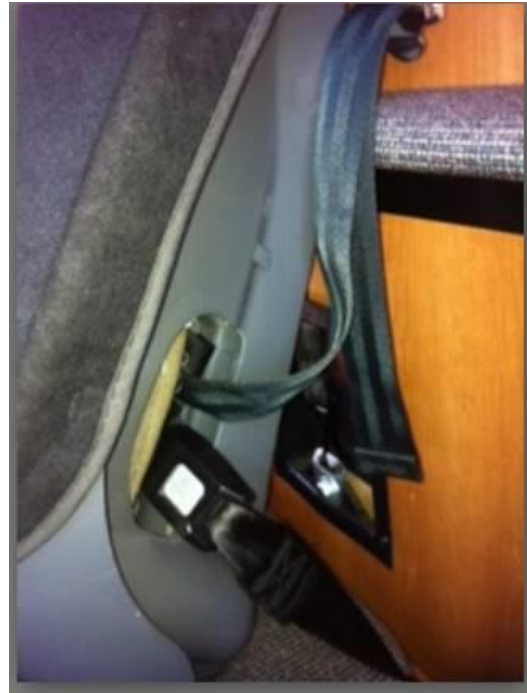
6) Lap belt secured