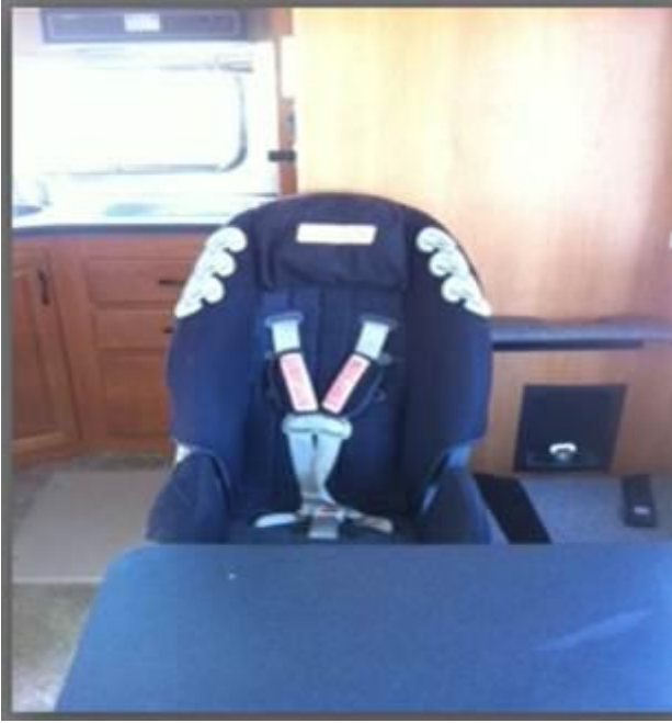
7) View of child seat from opposite side of dinette